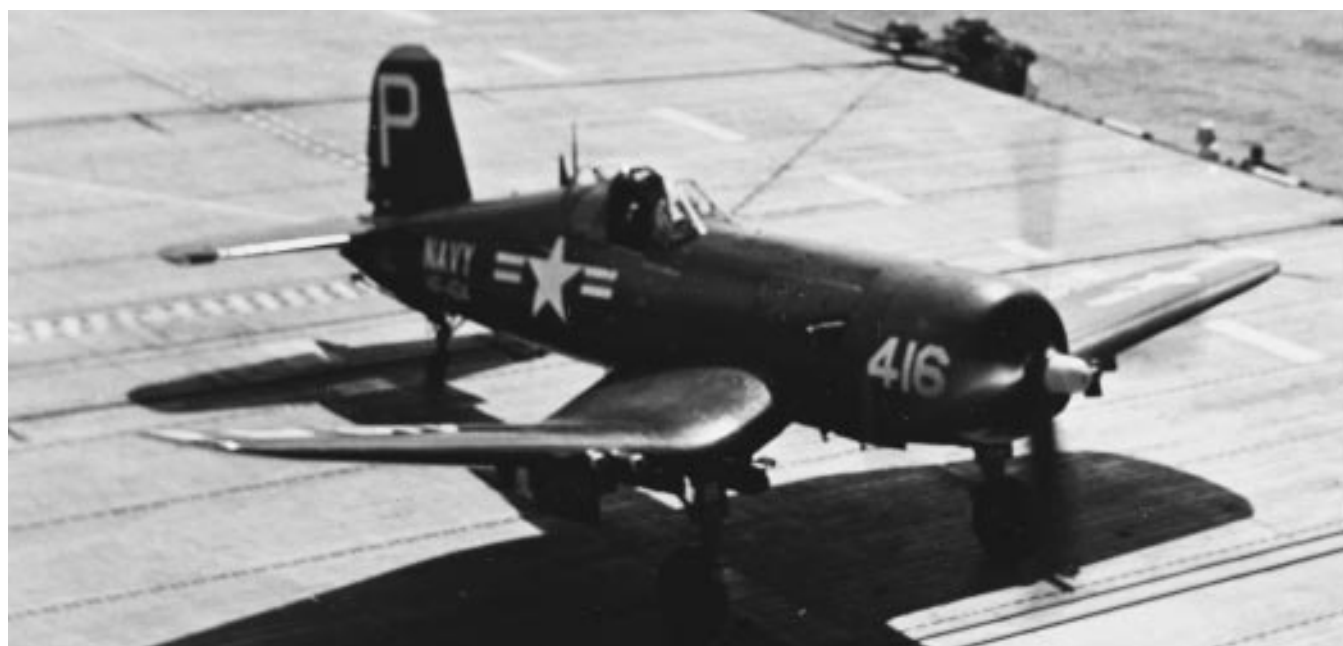
A squadron F4U-5 aboard Randolph (CVA 15), circa 1953.